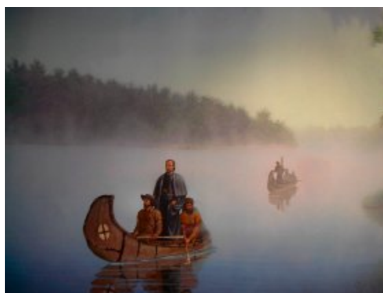
"Father Marquette" Mural in the Visitor Center by Chase Studios, Cedar Creek, MO

Located 5 miles west of Grafton, Pere Marquette State Park comprises 8,050 acres making it Illinois' largest state park. The Park is famous for the beauty of its fall colors and as a home for bald eagles in the winter. In addition to the spectacular views of the Illinois and Mississippi rivers from several scenic overlooks, visitors can take advantage of a variety of year-round recreational activities, including hiking, biking, horseback riding, camping, fishing, boating, and taking part in interpretative programs.